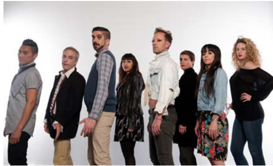
The OUTsider Board of Directors

The name “OUTsider” is a reference to queerness, and specifically the act of refusing shame and living one’s life “out,” including living “out” as an ally of the LGBTQI communities. “OUTsider” asserts our affinity with outsider sensibilities and outsider people – queers who take risks and dare to be different, as well as all marginalized folks who live and think outside the status quo. These various notions of the “OUTsider” inform the festival’s structure and content. Meet the OUTsiders below!